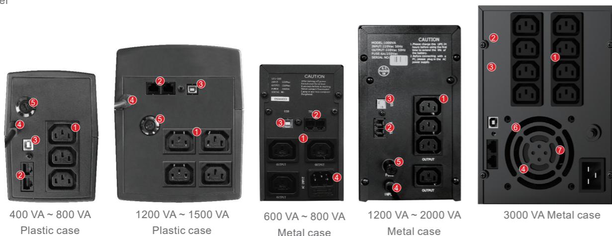
400 VA ~ 800 VA Plastic case